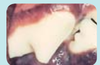
Healthy mouth with white teeth and healthy pink gums